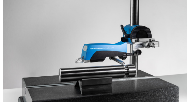
Transverse probing without retooling