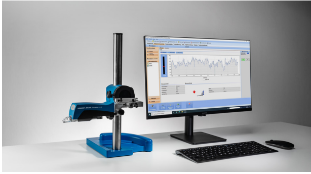
Waveline W15 with optional height measuring stand HS300 and monitor

Modular roughness measurement in every position