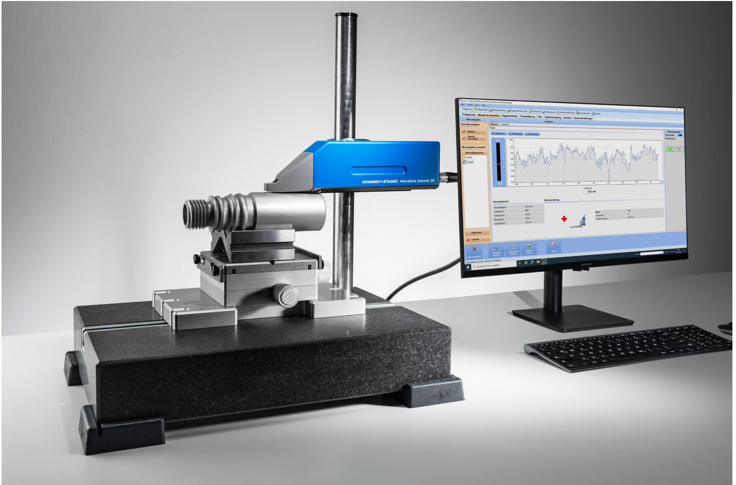
Waveline W40 with optional MS300 measuring station, PC and accessories