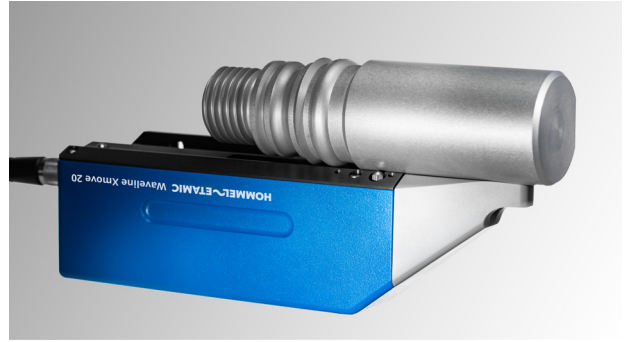
Measurement in any position, even upwards